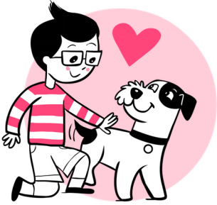
Pet dogs gently with one hand, collar to tail (not on the head).