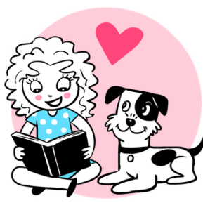
Sit WITH dogs, not ON them.