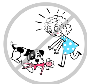
...EVEN if it's yours! Ask a grown up for help.