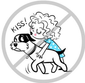
DON'T kiss, hug or pick up dogs.