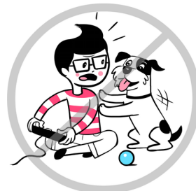
DON'T yell, scare, hurt or tease dogs.