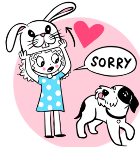
Learn what dogs are saying and listen when they need you.