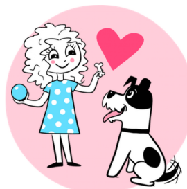
Train and play with dogs using treats and toys.