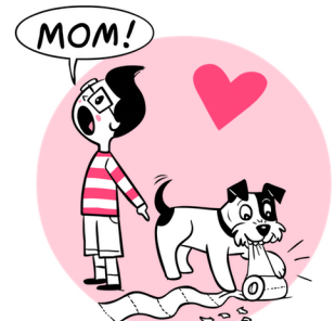
Let grown ups take care of dogs when they have something they shouldn't.