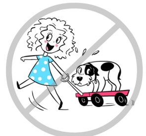
DON'T be bossy (or make dogs do things they don't want to).