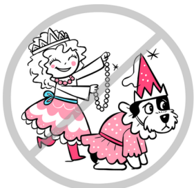
DON'T dress up dogs.