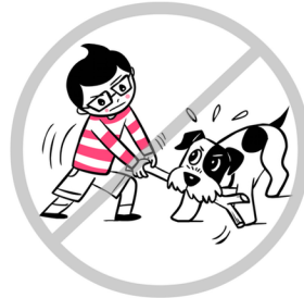
DON'T take anything from dogs...