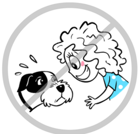
DON'T put your face in dogs' faces.