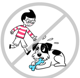
DON'T go up to dogs when they're eating or chewing.